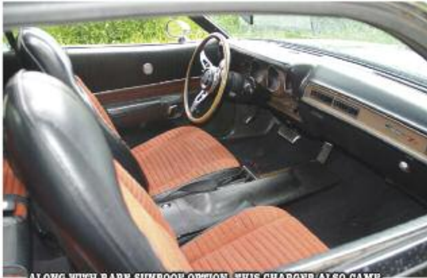
ALONG WITH RARE SUNROOF OPTION, THIS CHARGER ALSO CAME WITH CLOTH INSERT SEATS.